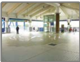
CTB 1/F (C002) Area: 120.40 sq.m (1,317.51 sq. ft)