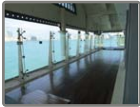
Seaview Corridor + access lobby Area: 132.12 sq.m (1,422.14 sq. ft)