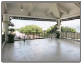
CTB 1/F (C001) Area: 50.04 sq.m (538.63 sq. ft)