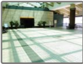
Public Viewing Deck (P001) Area: 320 sq.m (3,444.78 sq. ft)