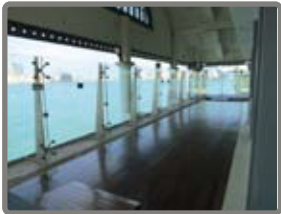
Seaview Corridor + access lobby Area: 132.12 sq.m (1,422.14 sq. ft)