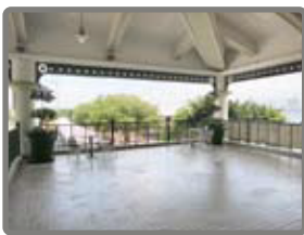
CTB 1/F (C001) Area: 50.04 sq.m (538.63 sq. ft)