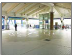
CTB 1/F (C002) Area: 120.40 sq.m (1,317.51 sq. ft)