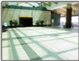
Public Viewing Deck (P001) Area: 320 sq.m (3,444.78 sq. ft)